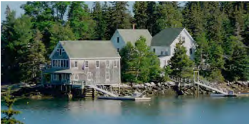
Hog Island, Maine, today.