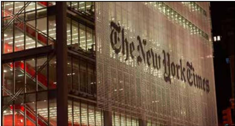
The industry term for obituary writing at papers like The New York Times is “Walking the Dead Beat.”

While most death notices are written by the family and friends of the deceased, major papers like the New York Times have full-time staffers who write just obits—the industry term is “walking the dead beat.”