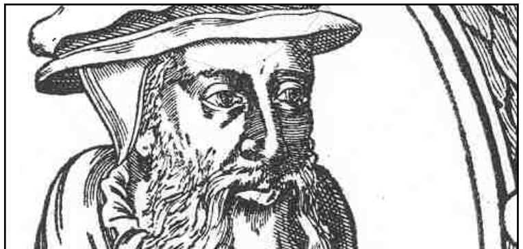
Many Christian reformers, such as John Knox (1514-1572) opposed the delivery of funeral sermons. Illustration from Theodore Beza’s Icones .

The eulogy, or funeral oration, has seen an ongoing shift in focus since ancient times and through the millennia: