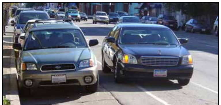
Double Parking.