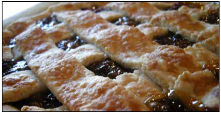
Raisin Pie.