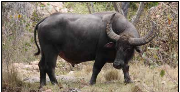
Water buffalo are a common sight (and taste) at Toraja funeral feasts.