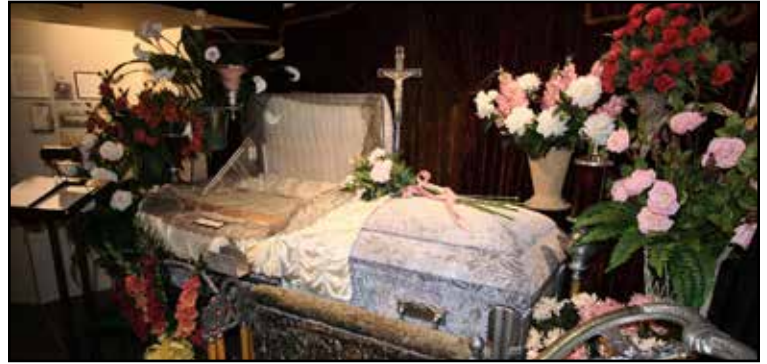
Coffin (display), Museum of Funeral Customs, Springfield, IL.