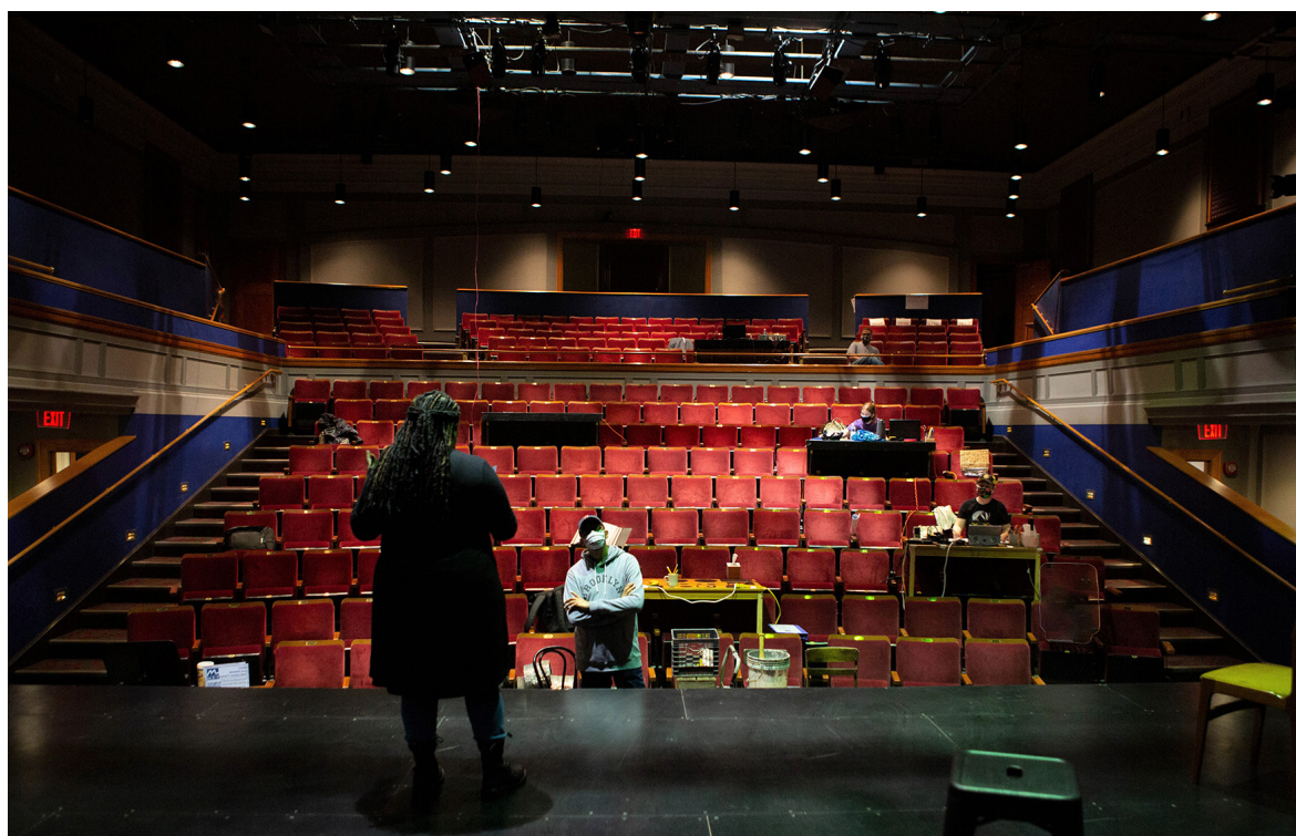
The Until the Flood in the first week of rehearsal at MRT's Liberty Hall.