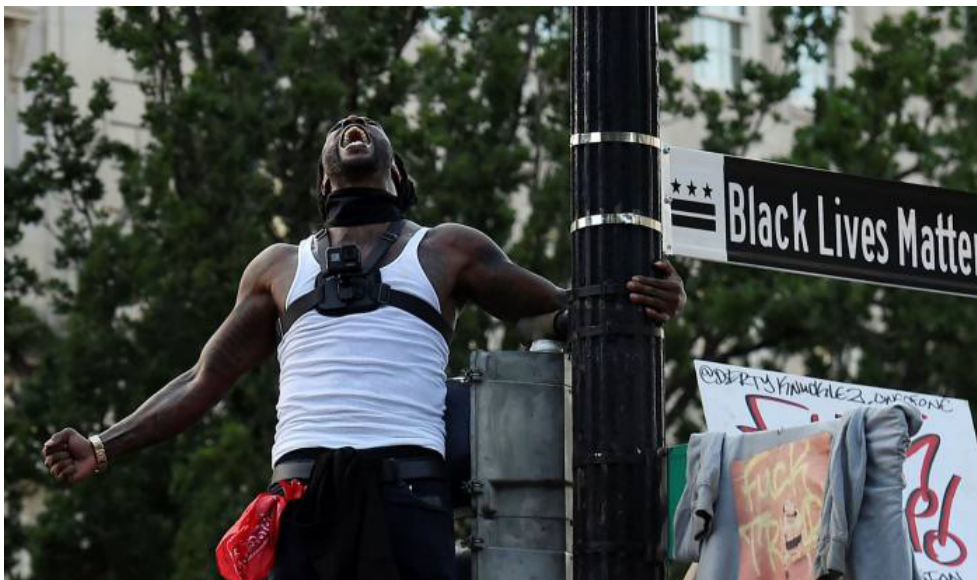
(left) A protester in Washington, D.C. (next page) Michael Brown and Darren Walker.

4. Identify a character from Until the Flood that you share a point of view with. How is this character similar to you? In what ways are they different from you?