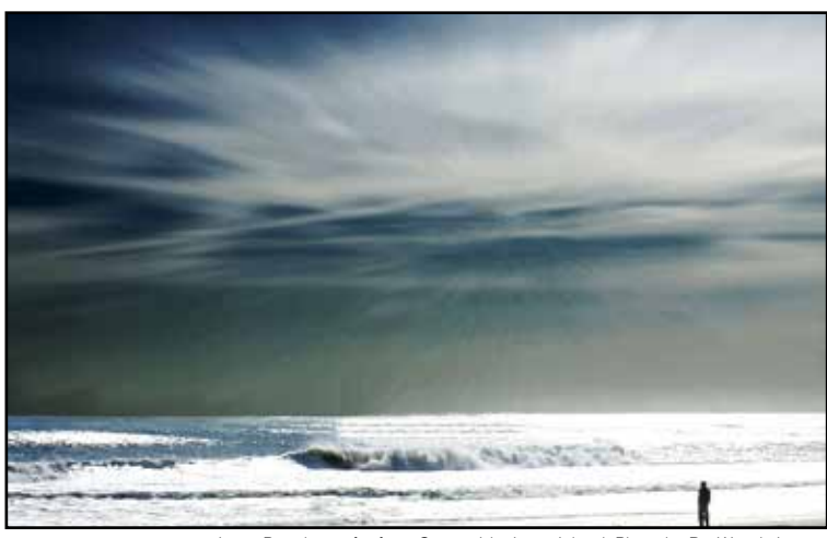
Long Beach, not far from Oceanside, Long Island.