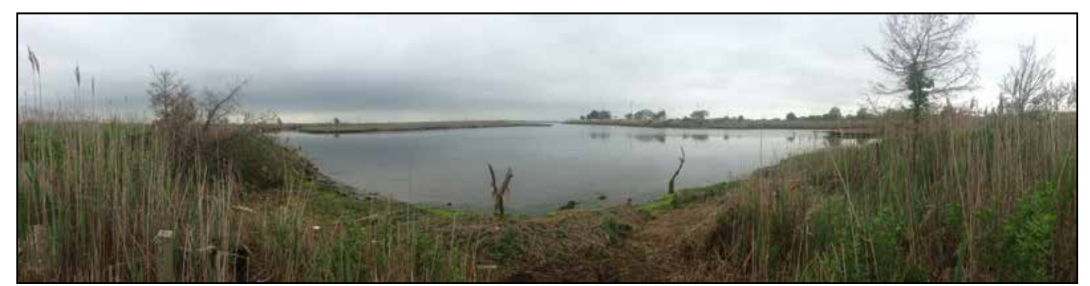
Oceanside Marine Nature Study Area. Barely a mile from the Atlantic Ocean, Oceanside's natural landscape is characterized by winding estuaries and tall marsh grass.