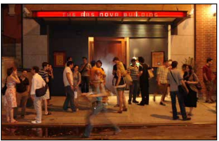
The Ars Nova Building, in the Hell's Kitchen neighborhood of Manhattan.

"...from the beginning he was writing with absolute authenticity about the places he grew up and the people he knew. His craft has developed over the years, but that deep sense of truth remains the same."