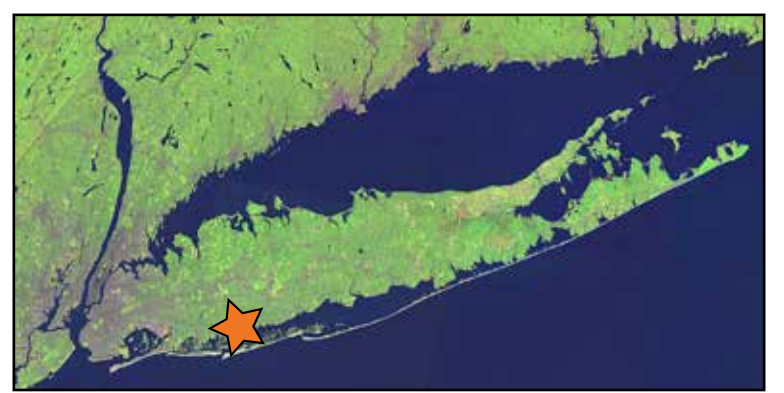
Long Island is the largest island in the contiguous United States, in both end-to-end distance and total land area.

Oceanside takes place on Long Island in the hamlet of Oceanside, New York. Take a look at the real-life location that inspired the play.