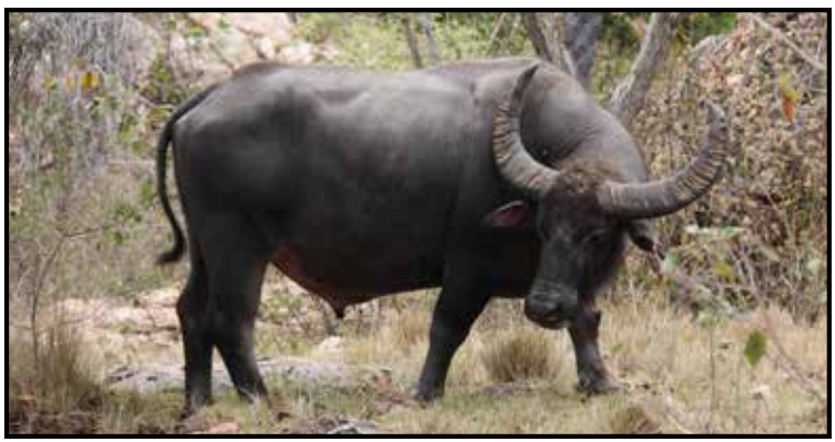
Water buffalo are a common sight (and taste) at Toraja funeral feasts.

• In some parts of Jamaica, it is traditionally believed that the soul of a deserving person will travel to Africa immediately after death. Several "Johnny Cakes" (similar to cornbread), in addition to being eaten at the funeral feast, are place in the casket to nourish the soul on its travels. In fact, the name "Johnny Cakes" is a derivation of "Journey Cakes."