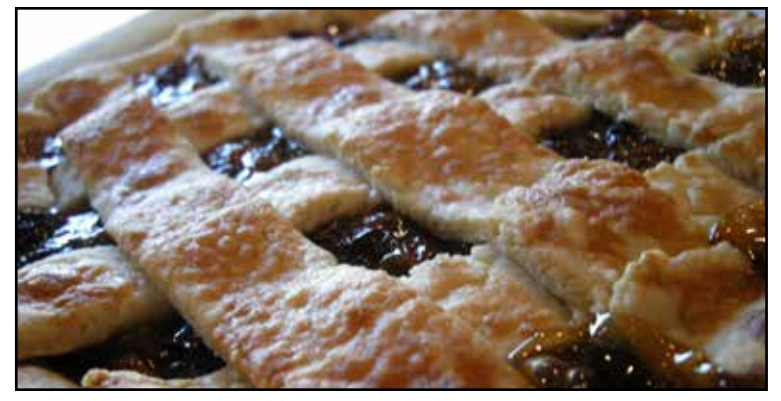
Raisin Pie.

• At a Belgian funerals, much of the food is black in color, such as black bread ("Soul Bread"). This often means high chocolate content, as in Belgian funeral cake.