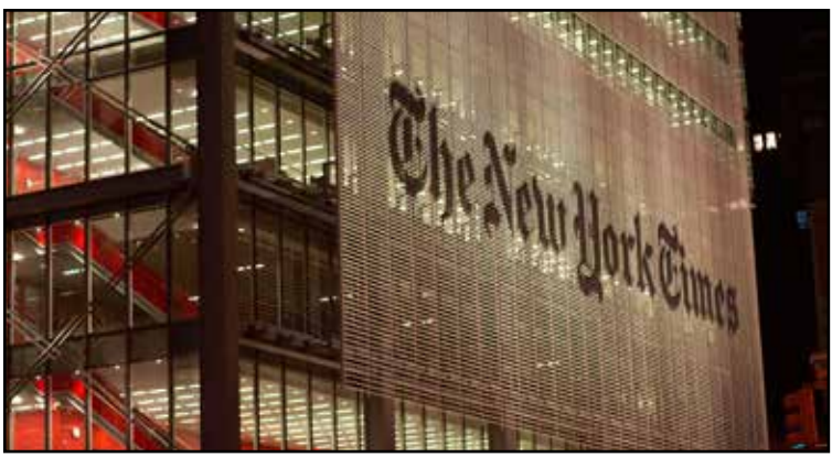
The industry term for obituary writing at papers like The New York Times is "Walking the Dead Beat."

While most death notices are written by the family and friends of the deceased, major papers like the New York Times have full-time staffers who write just obits—the industry term is "walking the dead beat."